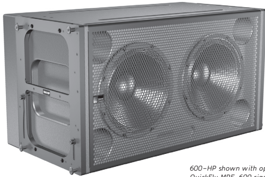
600-HP shown with optional QuickFly MRF-600 rigging frame